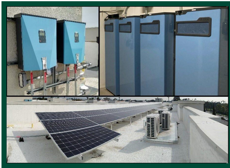
Figure 1: Photos of BESS and PV Systems

This project was designed to conduct research related to the design, interconnection, installation, commissioning, system performance, customer objectives and grid impacts of the installed energy storage system and solar photovoltaic array at Mosaic Gardens at Pomona. The lessons learned and best practices were captured and delivered as knowledge transfer to key constituents within various departments in Southern California Edison. The primary objective of this project was to demonstrate how customer storage can be leveraged and to quantify impacts to both customers and grid stakeholders.